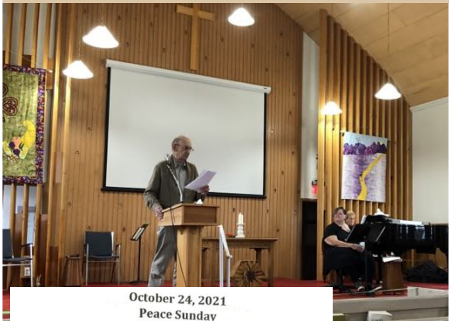
October 24, 2021 Peace Sunday

Zion United celebrated, in worship, 'Peace Sunday' with a very meaningful combination of music, readings and reflection. Thank You to all those who contributed.